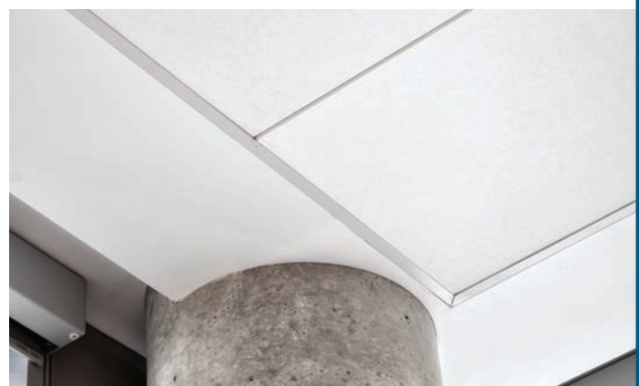
ROCKFON's stone wool ceiling panels are made from basalt rock and contain up to 42 percent recycled material to support ESCB's LEED Gold criteria. Stone wool ceiling panels also are lightweight and cut easily to accommodate the facility's columns, light fixtures and sprinklers.