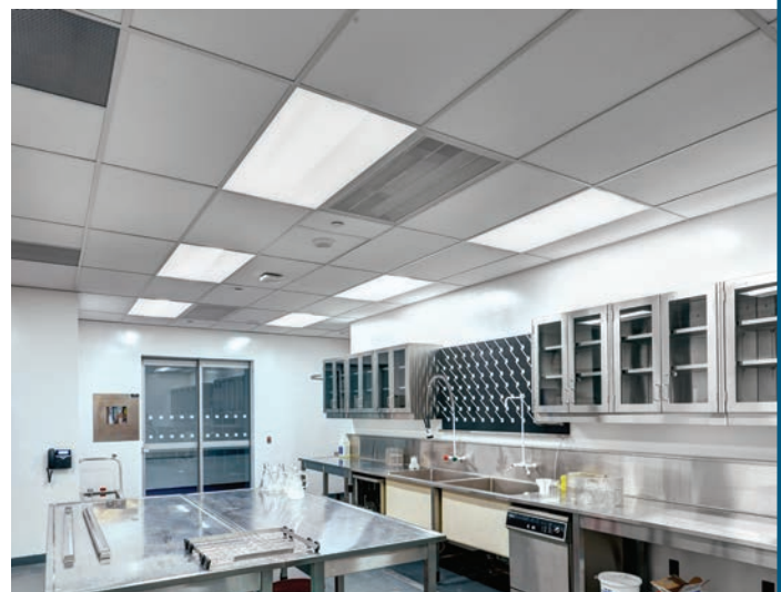
ROCKFON ceiling systems help meet multiple goals including CaGBC's LEED Gold criteria.

Working closely with the team, Nelmar Drywall Company Ltd. depended upon Patene Building Supplies to supply ROCKFON's ceiling systems throughout the phased construction. In selecting