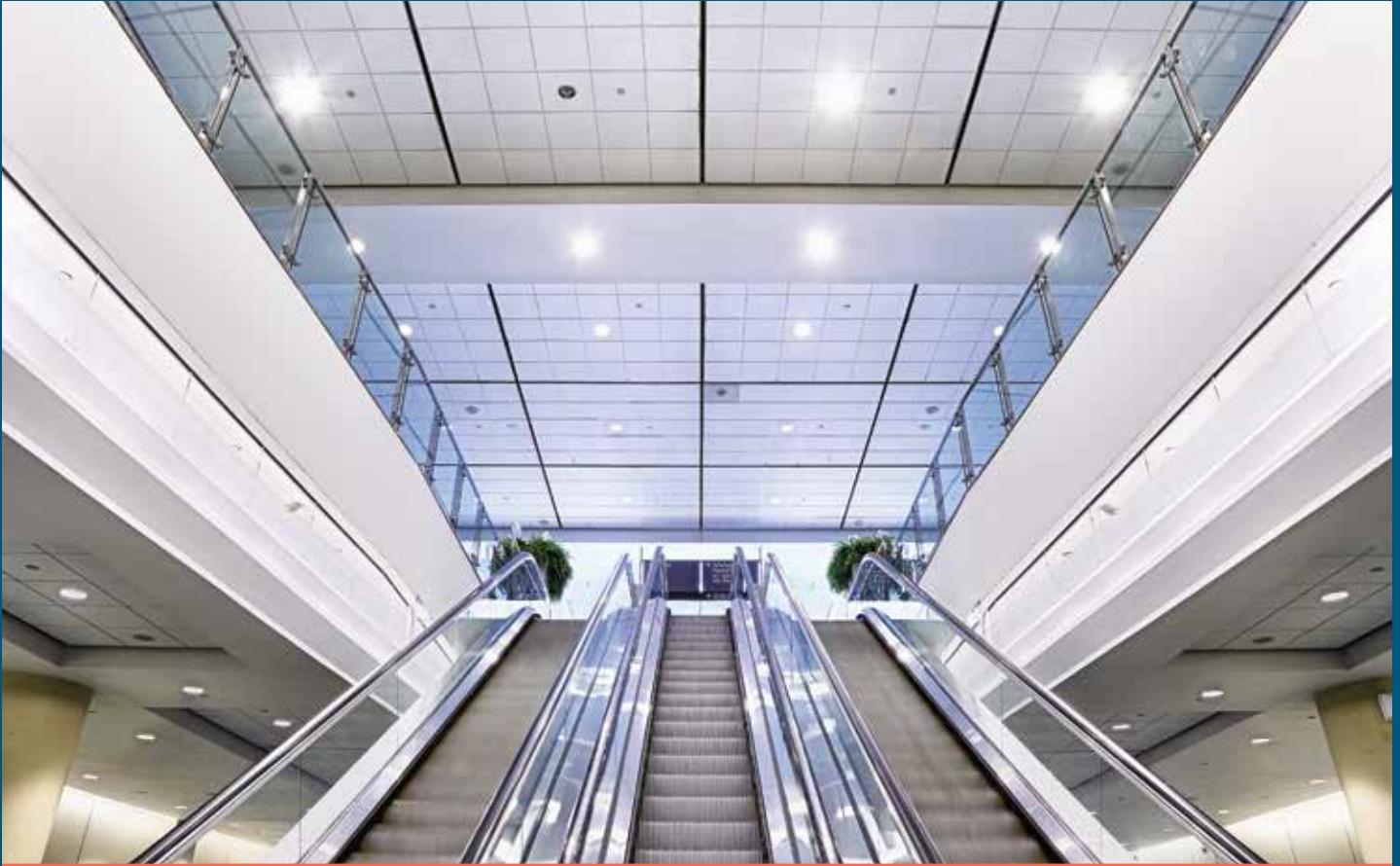
A modern look and modern performance were key drivers for MTCC selecting Rockfon Koral acoustic ceiling tiles.

In one year alone, conventions and trade shows held at the MTCC generated a direct-spending economic impact of $523.7 million dollars to the community. This influx of funds into the city of Toronto translates into 6,000 jobs and the total taxes generated are estimated to be $177.5 million dollars.