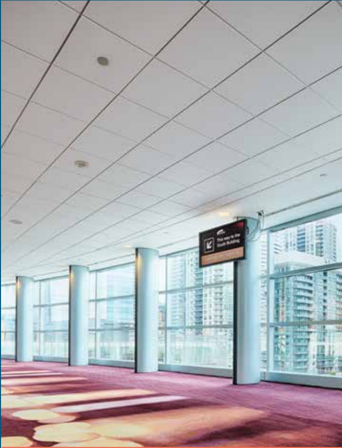
Rockfon Koral's high NRC mitigates the cocktail affect and contributes to overall acoustic comfort.

In addition, stone wool can withstand temperatures up to 1177 degrees Celsius (2150 degrees Fahrenheit). It does not contribute to the development and spread of fire, giving occupants the extra minutes they may need to escape a fire.