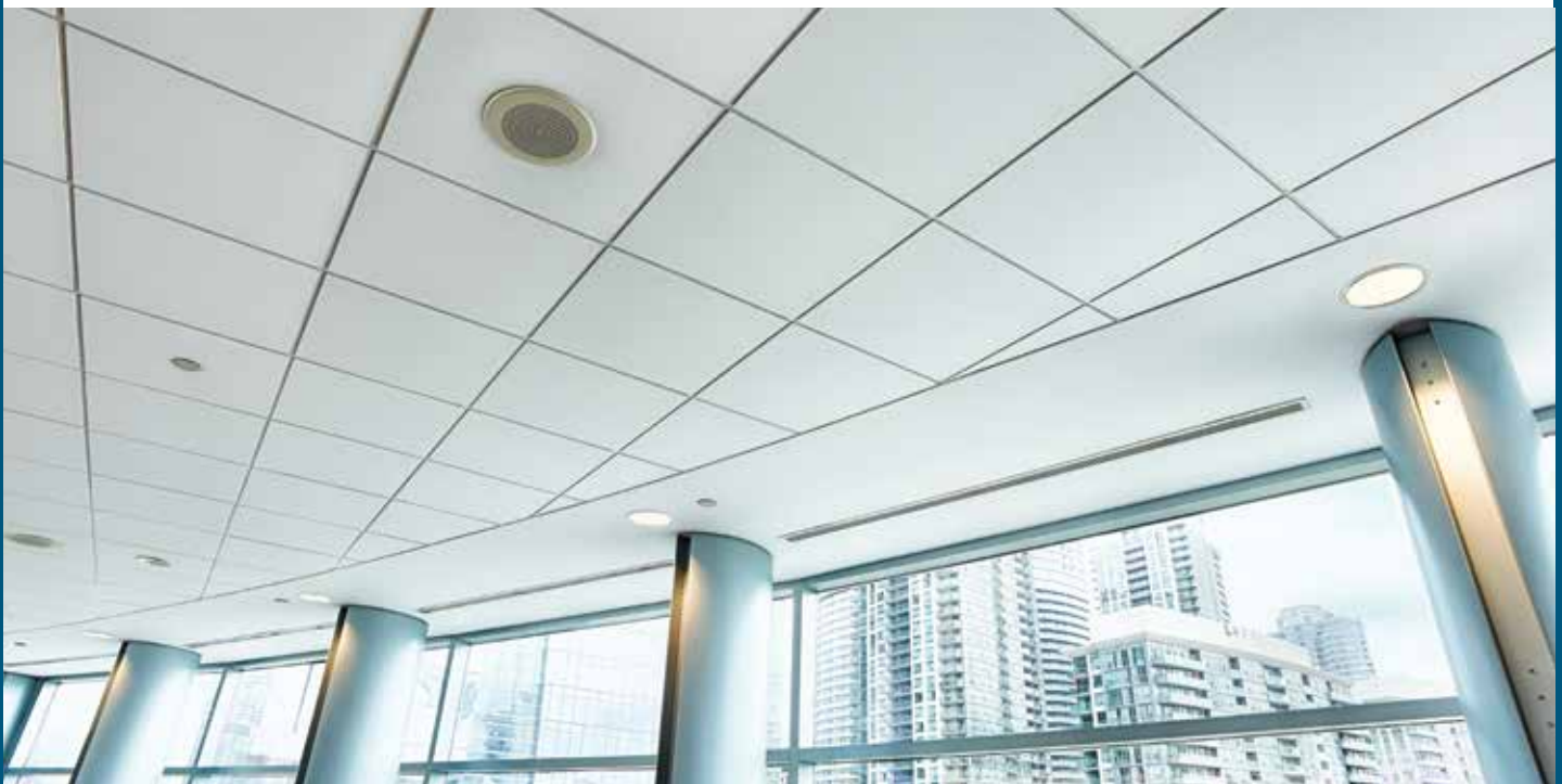
The high light reflectance of the panel reflects both daylight and light from high-efficiency fixtures maximizing the use of natural light.

Pleased with MTCC South Building renovation's ceiling installation and its resulting aesthetic, performance and sustainability qualities, Jaikaran proudly describes the convention centre as offering: "Top-of-class service in a first-class venue in a world-class city. And yes, it's the only facility that has hosted both a G20 and a G7 Summit," as well as Toronto Construction Association's Construct Canada, Canada Green Building Council's national conference and the U.S. Green Building Council's Greenbuild.